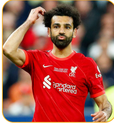
MOHAMED SALAH (LIVERPOOL)

Egypt did not qualify for the 2022 FIFA World Cup and Mohamed Salah will be looking to make up for this disappointment with inspirational performances throughout the 2022/23 Premier League.