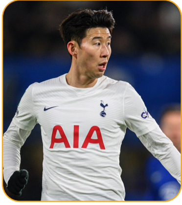
SON HEUNG-MIN (TOTTENHAM HOTSPUR)

Son will be central to Spurs title challenge this season.