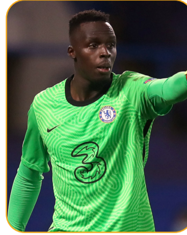
EDOUARD MENDY (CHELSEA)

Edouard Mendy had a breakthrough season in 2021/22