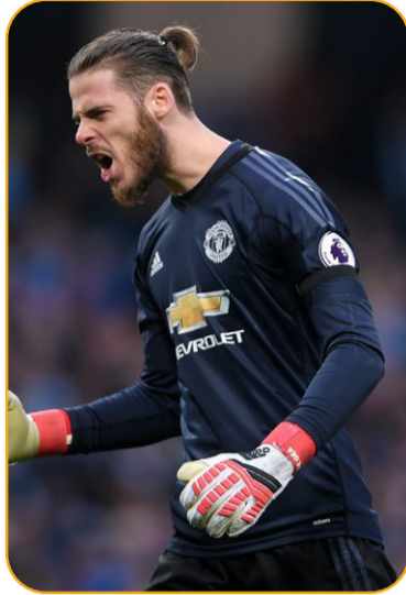
DAVID DE GEA (MANCHESTER UNITED)

David de Gea has managed to keep 130 clean sheets in 378 Premier League appearances, and he won the Golden Glove in 2017/18